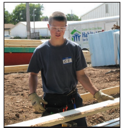
CJ assists on the building project.

Giving back to the community is a value emphasized through Rawhide programs that youth can take back to their own communities.