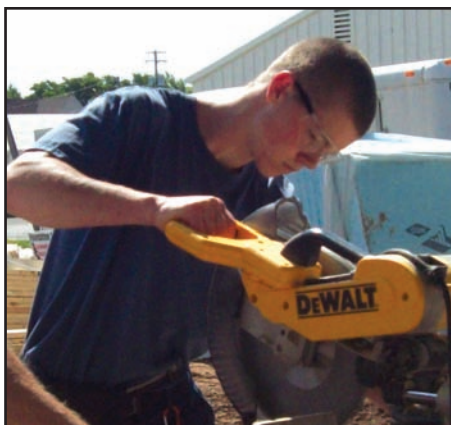
Youth receive valuable work experience using power tools.