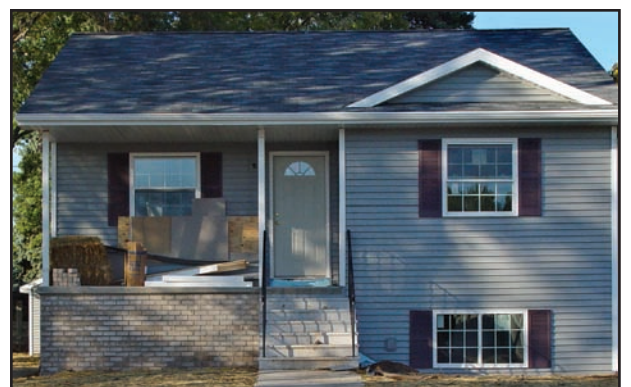
Completed home in Appleton, Wisconsin.