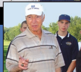
Bart Starr gave the youth positive encouragement.

On September 21 Rawhide youth had the opportunity to caddie for the Green Bay Chapter-NFL Alumni Charity Golf Classic. Each student was paired with a former NFL player and provided caddie duties for them during the event. Green Bay Packers greats Jerry Kramer, John Brockington, Lynn Dickey, and of course, Bart Starr, were just a few of the former players on hand for the event. The event is a rewarding experience for Rawhide youth and can leave a lasting impression on those who need positive role models.