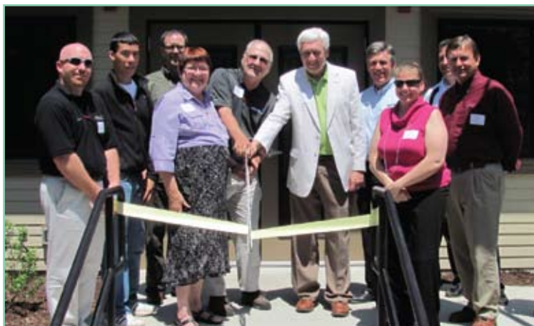
Rawhide donors and Friends celebrate the ribbon cutting