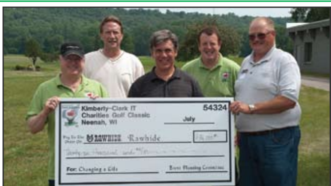
Kimberly-Clark Leadership (left) presents Rawhide with a $36,000 check

On July 16, Kimberly-Clark held its annual ITS Charity Golf Classic at High Cliff Golf Course in Sherwood. Rawhide was honored to be one of three recipients of the proceeds from the event. This year's gift was $36,000 to benefit residential care for the Smith Boys Home, a home built by their foundation in 1992. Rawhide is very grateful to Kimberly-Clark for this support.