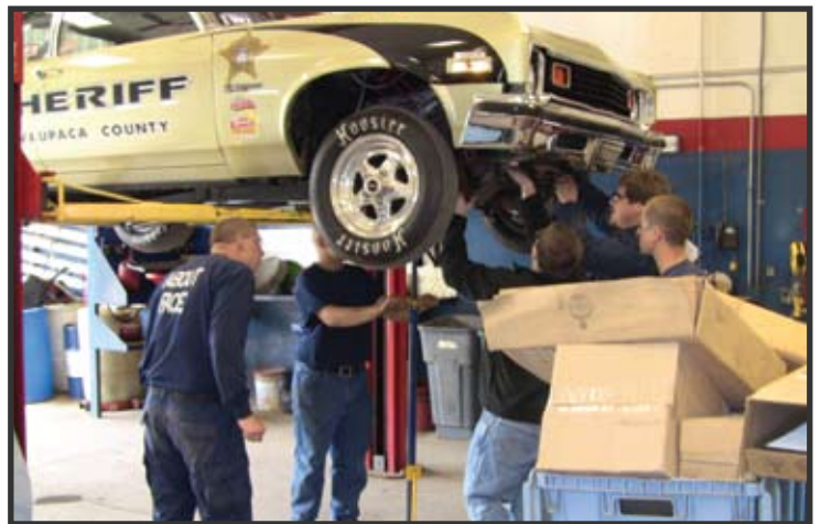
Youth work on the race cars each week in a school elective course