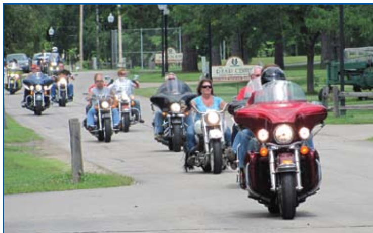
Motorcyclists arrive at Rawhide as part of the inaugural ride